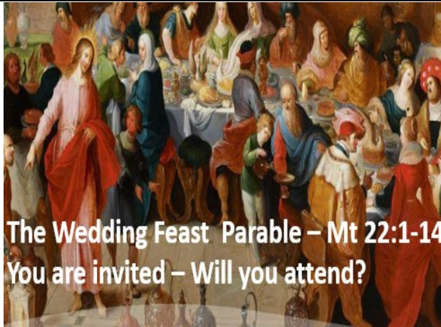
The Wedding Feast Parable – Mt 22:1-14 You are invited – Will you attend?

“In the parable of the wedding feast, Jesus teaches us about God’s boundless love and the invitation to His Kingdom. Just as the king invited guests to the wedding. God extends His invitation to all. Some may choose to decline, distracted by worldly concerns, but others, both good and bad, accept with open hearts.